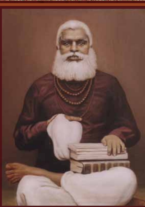
nitya-līlā-praviṣṭa om viṣṇupāda SACCIDĀNANDA ŚRĪLA BHAKTIVINOḌA ṬHĀKURA