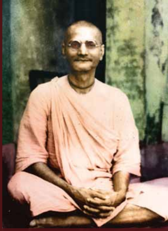
nitya-līlā-praviṣṭa om viṣṇupāda ŚRĪ ŚRĪMAD BHAKTI PRAJÑĀNA KEŚAVA GOSVĀMĪ MAHĀRĀJA