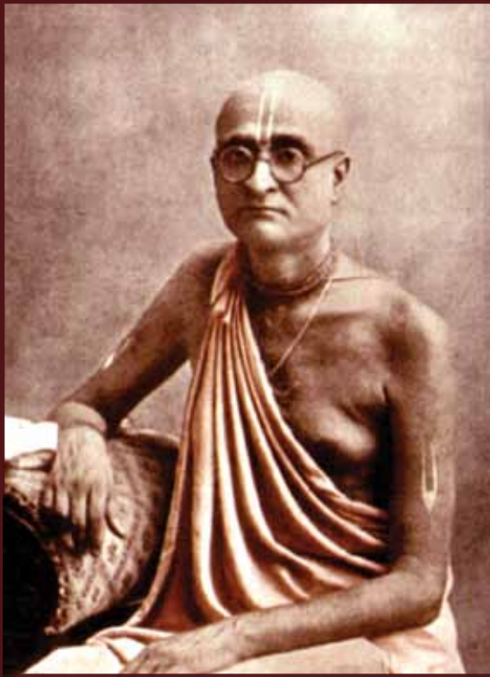
nitya-līlā-praviṣṭa om viṣṇupāda ŚRĪ ŚRĪMAD BHAKTISIDDHĀNTA SARASVATĪ ṬHĀKURA PRABHUPĀDA